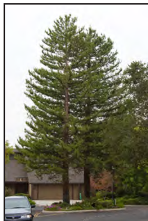
Redwood trees May 10 and October 18, 2010 respectively