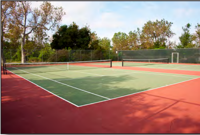
Overview of FGE Tennis Courts