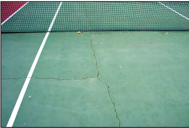
Cracking damage due to roots or buried water pipe