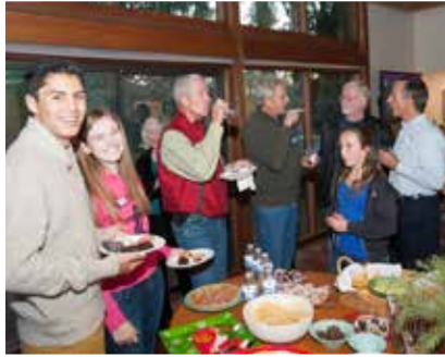
FGE Holiday Open House 2013

The 2014 Holiday Open House will be held Sunday, December 7th from 3:00–6:00 pm.