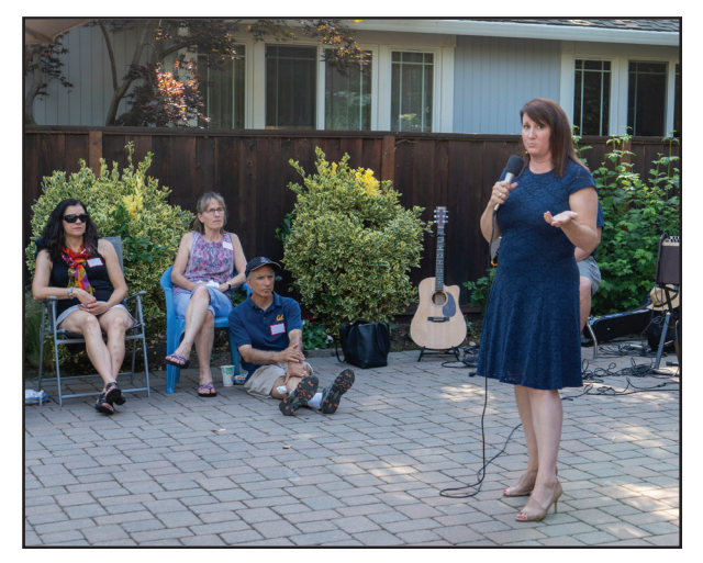
Lawyer from Berding & Weil LLP